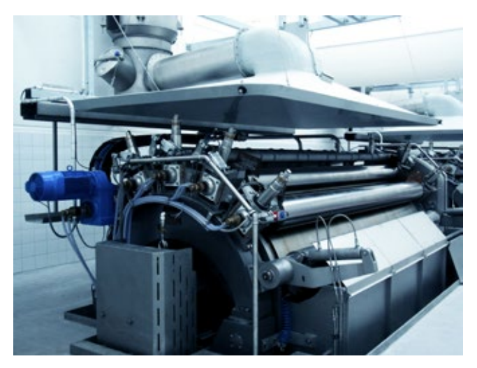
ANDRITZ Gouda drum dryer

One discharge screw and a pneumatic conveying system transport the dried starch to the downstream process steps before it is packed or stored in a silo. The drum dryer is available in a variety of sizes, from 0.75 up to 28 m<sup>2</sup>. More than 1.000 ANDRITZ Gouda drum dryers for this application are operating around the world.